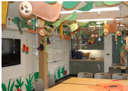
Our Rainforest Canopy!!

Kindergarten Enrichment is designed to take your Kindergartener on a more in-depth exploration of thematic subjects through individualized and group projects. Our experienced staff will provide lessons with a focus on literacy, science, math, critical thinking, and problem solving skills in a play based and caring environment, allowing students to learn and grow beyond what a half day Kindergarten can offer. We will offer five different and exciting themes during the school year. Sign up for one or all five!