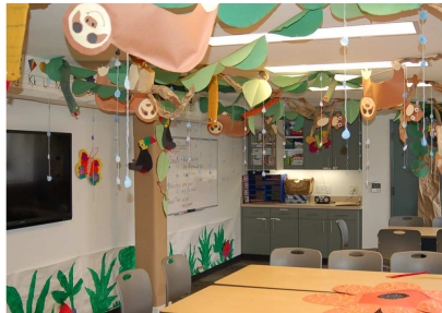
Our Rainforest Canopy!!

Kindergarten Enrichment is designed to take your Kindergartener on a more in-depth exploration of thematic subjects through individualized and group projects. Our experienced staff will provide lessons with a focus on literacy, science, math, critical thinking, and problem solving skills in a play based and caring environment, allowing students to learn and grow beyond what a half day Kindergarten can offer. We will offer five different and exciting themes during the school year. Sign up for one or all five!