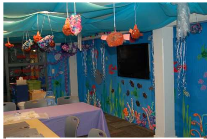
Under the Sea!

If St. Matthew's School is closed for either weather related emergencies or a scheduled holiday / in-service, classes will not be rescheduled.